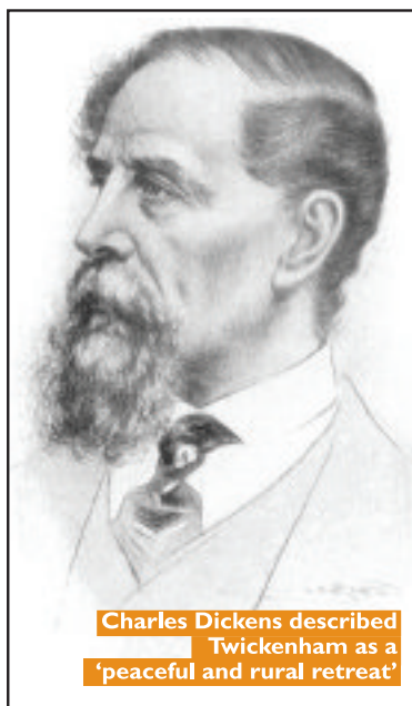
Charles Dickens described Twickenham as a "peaceful and rural retreat"

In the writers, poets and historians category, celebrated novelists, such as Charles Dickens – who described Twickenham as a "peaceful and rural retreat" and used the area as a location in Nicholas Nickleby, Little Dorrit and Our Mutual Friend – are featured alongside local historians and writers, includ-